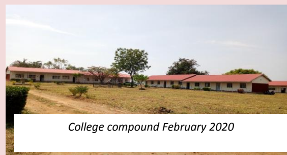
College compound February 2020

The college plans to carry out some renovation of the infrastructure including the water system, electric installation and building of dormitories for the female students (whose numbers are rapidly growing), staff quarters since new staff members had to be hired to match the student numbers. We continue praying for lasting peace in Kajo-Keji and South Sudan entirely so that we can return to our premises in Kajo-Keji. We also call upon our partners to remember us in their prayers especially as we plan to go back. Prayer points include raising finances for transporting the college assets from Moyo, Uganda to Kajo-Keji, South Sudan and finances for renovating the college infrastructure destroyed during the two-year- conflict in Kajo-Keji.