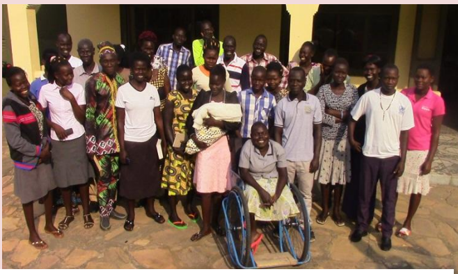
Business students at KCC pose for a snap

The situation in Kajo-Keji has improved since early 2019 and thus the college staff members regularly visit the premises to ensure cleanness and safety of the facilities from wild fire due to the overwhelming bush that has outgrown the college compound for the last two years.