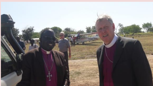
The Two Bishops pose for a photo at the airstrip

It was a fruitful visit with interaction with the staff members of the college, staff members of the Diocese of Kajo-Keji and students of Kajo-Keji Christian College.