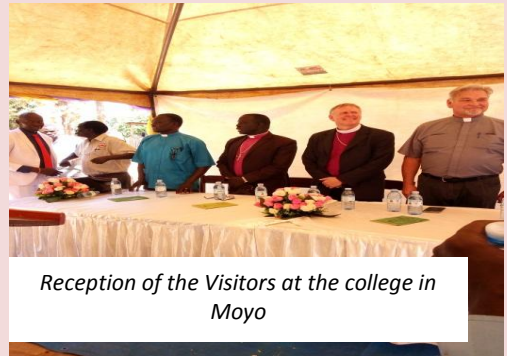
Reception of the Visitors at the college in Moyo

The visit was packed with activities which included trip to the