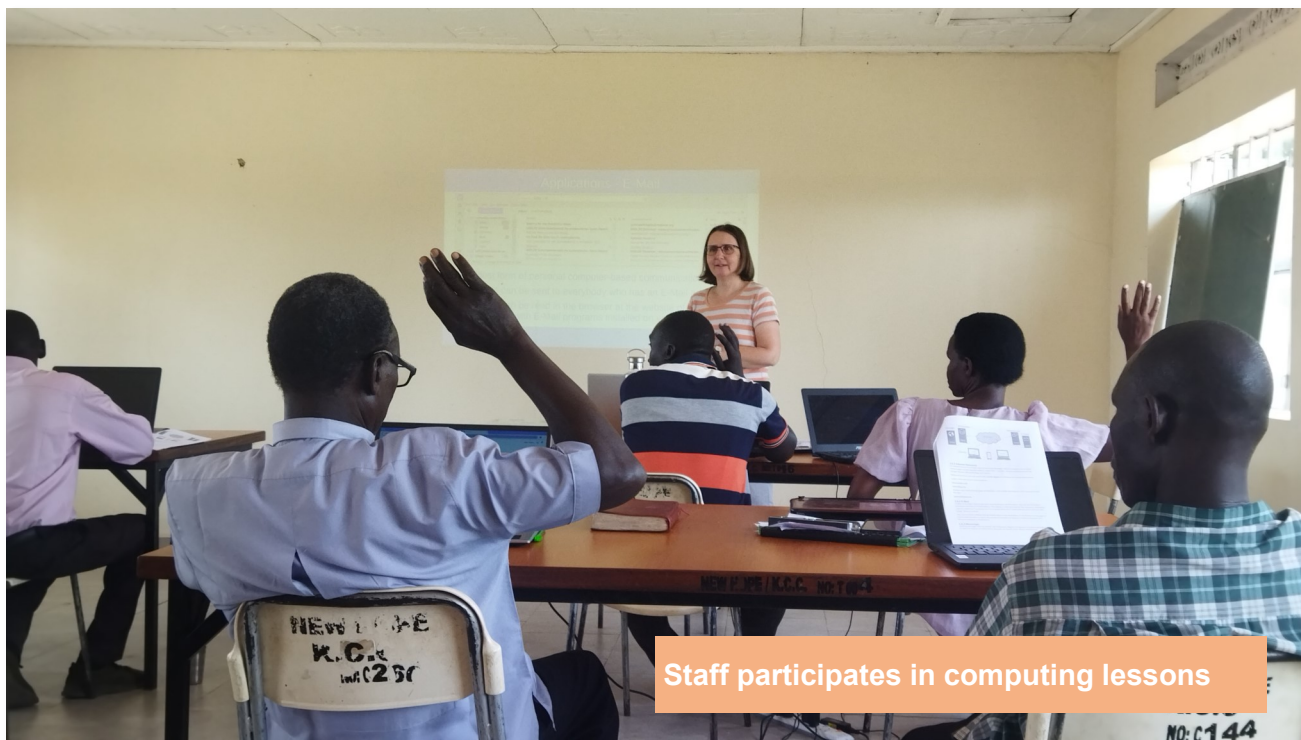
Staff participates in computing lessons

Kajo-Keji Christian College staff members were taught essential skills aimed at enhancing computing capacity.