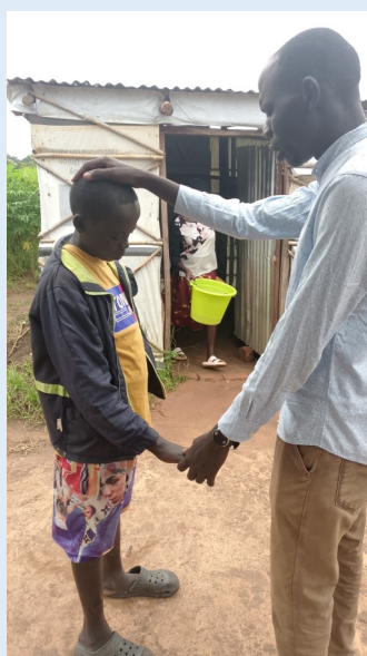
Student praying for community members

The students reached out to 36 households and 30 individuals attended the open-air sermon held in Romogi Centre.