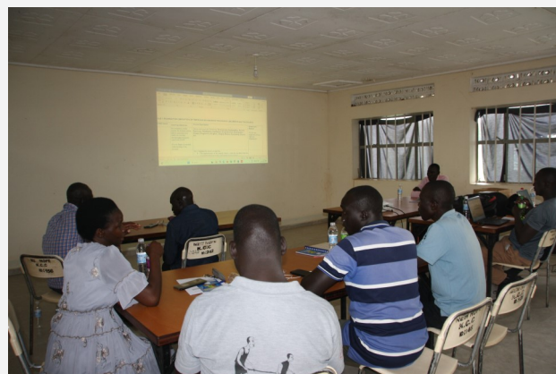
Staff for CCT curriculum review.

Through this transformative training initiative, the college is poised to become a leader in provision of holistic education to students.