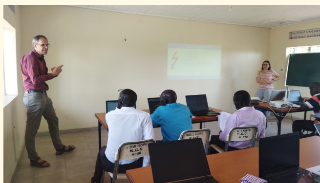
Staff for computing lessons

Thank God! This training aligns with the college Information Technology (IT) strategy of having productive staff members knowledgeable and skilled in using current technologies and tools.