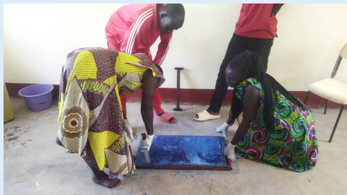
Trainees extracting bars of soap

With soap-making now as a practical life skill among trainees, the college hopes the initiative will inspire broader community engagement in development efforts.