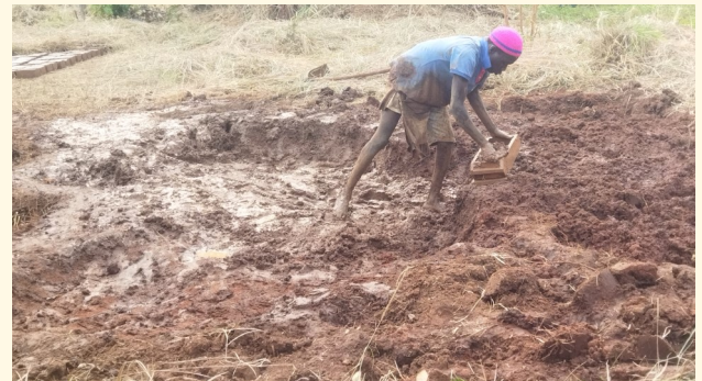
Brick mounding in action.

Each brick laid represents an investment and the economic dignity.