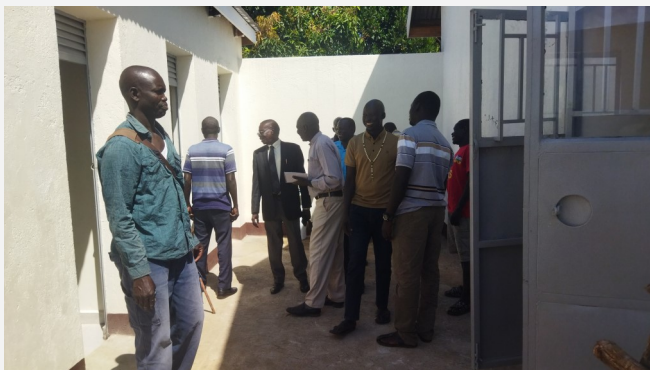
Tour of the Female Dormitory

The move embodies a shared vision of a nurturing environment. Participants could sense the dreams and aspirations beginning to take root within these walls.