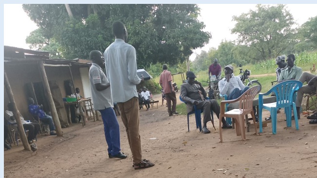
Students for open sermon

Students discovered that issues such as long distance to the church, busy home obligations, and illnesses hindered some from fully engaging in their faith.