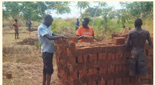
A group piling bricks