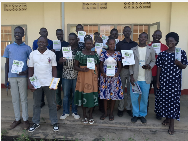
Students holding certificates and Bible Study books

The "Rooted in Jesus" programme, integral to the college's ministry, started during a time of exile in Moyo, Uganda. The structured, four-book curriculum encourages both students and staff members to engage in interactive, discussion-based Bible Studies, which foster deeper understanding and personal connection to the scripture. By completing the programme, graduates not only earn certificates, but also gain essential skills to foster spiritual growth in communities.