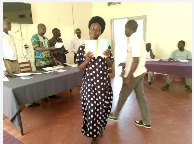
A student poises during the award.

The graduates were encouraged to form study groups in their local churches and start teaching using the Bible Study Books to increase outreach missions. Such reflects the commitment to discipleship and shining Christ's light through actions.